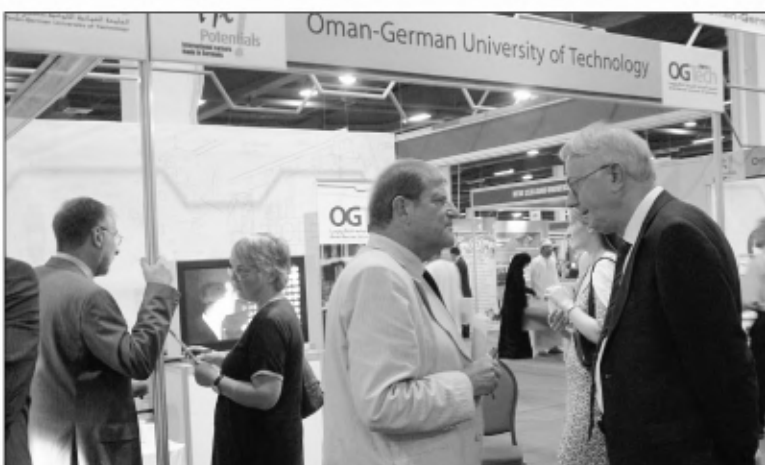
GERMAN Ambassador Klaus Geyer visiting the OGTech stall at GHEDEX 2007.

Oman needs skilled people and the key to success is co-operation with