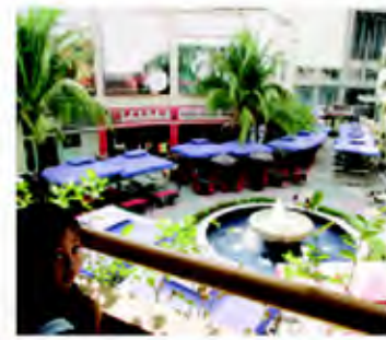
Far from the madding crowds