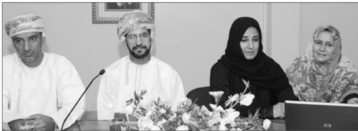
MUSCAT — The awareness team for the Majlis Ash'shura Sixth Term elections (2008-2011) yesterday continued its field visits in the Governorate of Muscat. The team visited the Directorate General of Education in Muscat urging citizens who haven't yet registered to speed up registration of their names in the Electoral Register. The team presented the Voter's Registration Form and screened a documentary on procedures and regulations of the Majlis Ash'shura elections. The citizens were advised to select the candidate who will best represent them at the Majlis's forth term.