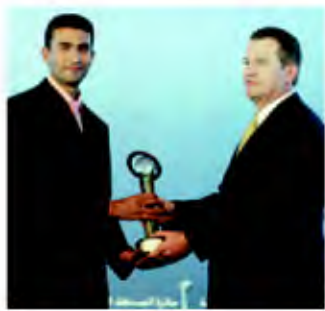
Arab Award for Palestinian photographer