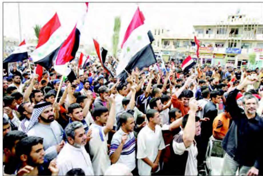
IRAQIS demonstrate in the Sadr City to protest against the concrete walls installed around an area in the capital yesterday.

"I do not agree on such barriers. I don't believe this is something good. We can set up less harsh barriers," he told a press conference in the northern city of Sulaimaniyah.