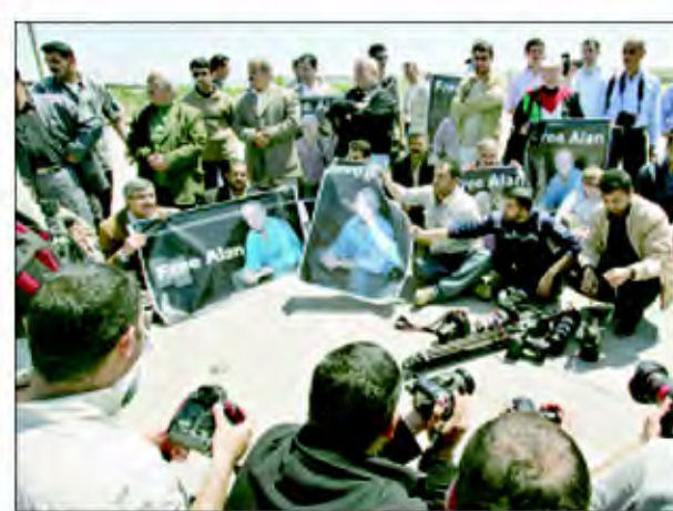
JOURNALISTS protest outside the Beit Hanun crossing into Israel in the northern Gaza Strip in support of BBC colleague Alan Johnston, kidnapped more than a month ago in the territory.

Hamas's Izz el Deen al Qassam Brigades launched eight rockets at Israel from